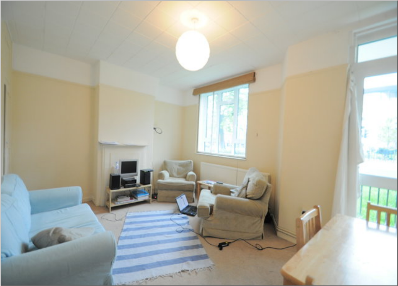
Leary House SE11