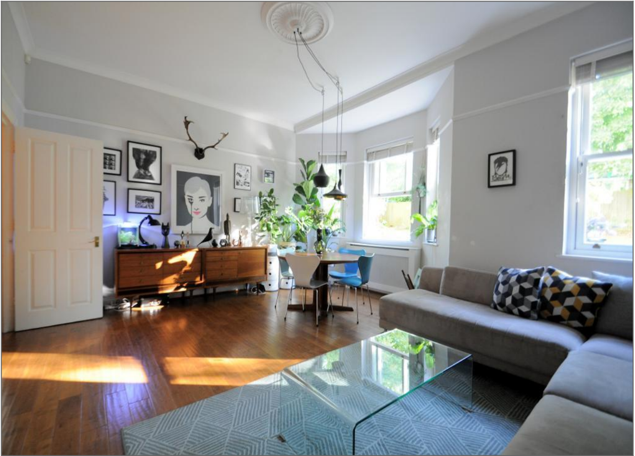
Lloyd Villas SE4