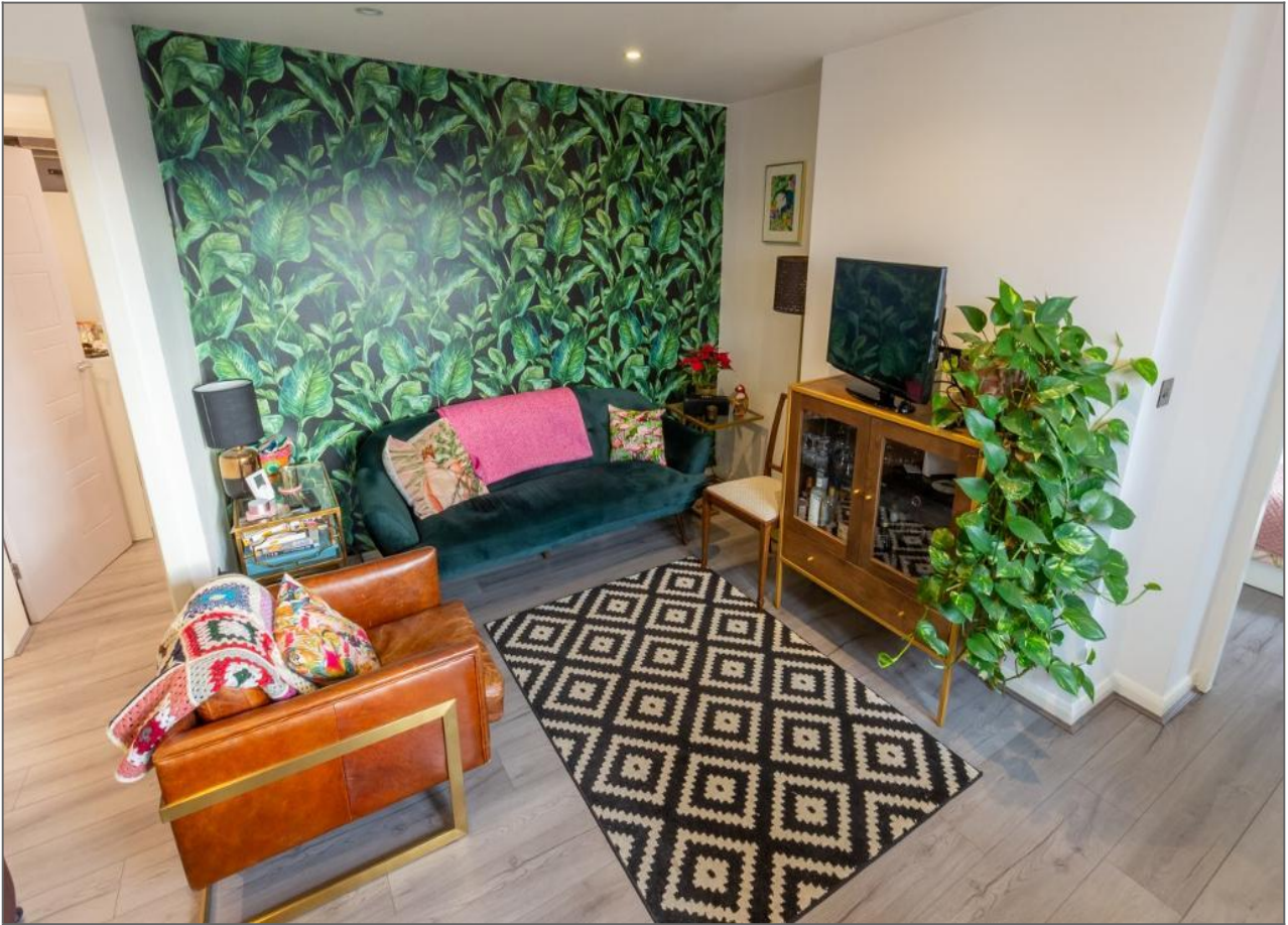
The Woodlands SE19